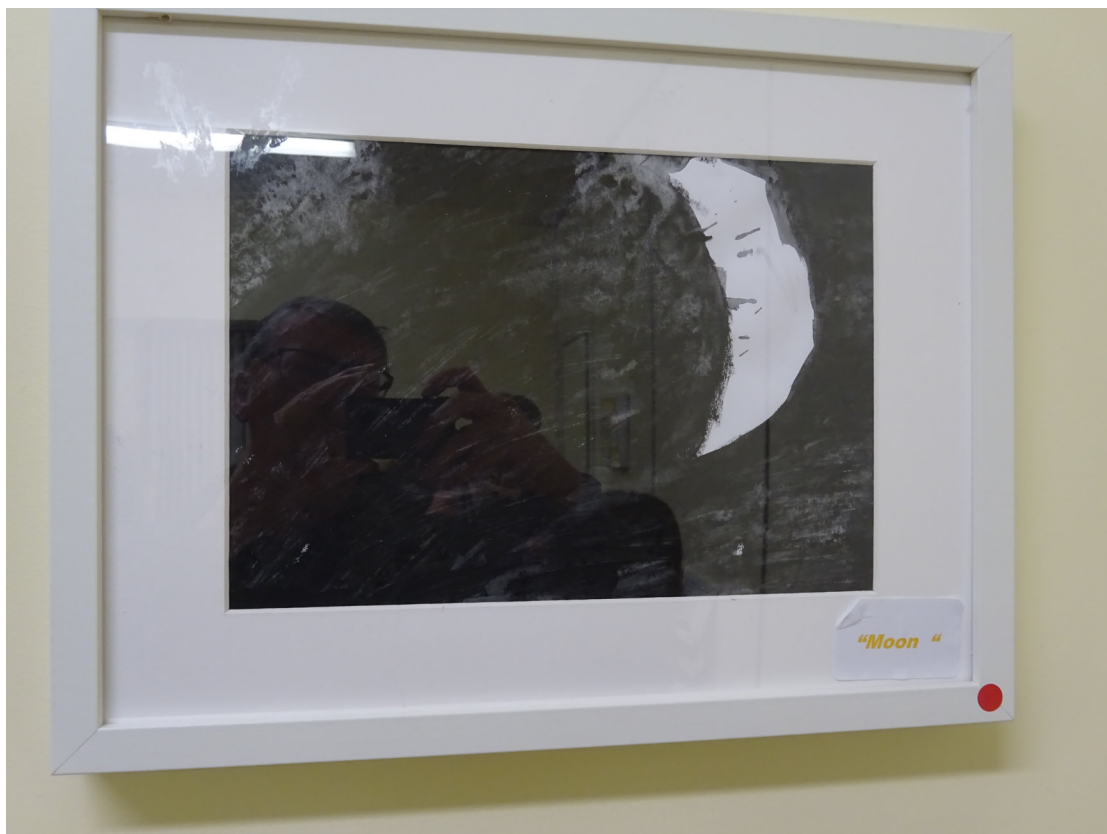
Below: The Moon